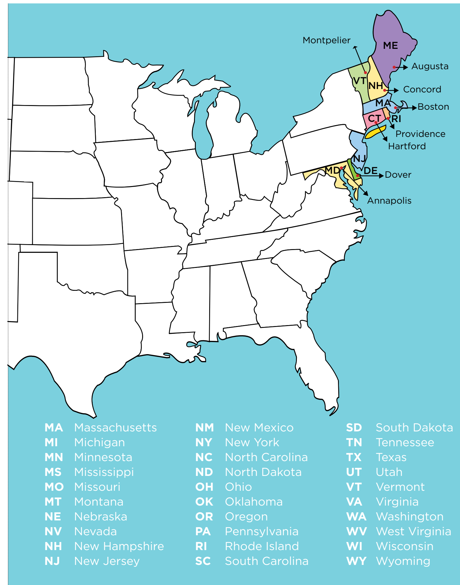
More worksheets at www.education.com/worksheets