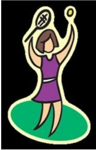
World Almanac for Kids

Tennis is one of the sports athletes will compete in.