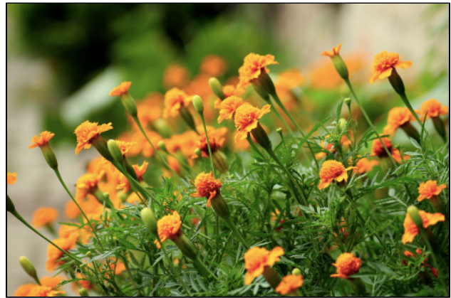
"Untitled" by _Alicja_ is licensed under CC0.

[1] When I think of the hometown of my youth, all that I seem to remember is dust — the brown, crumbly dust of late summer — arid, sterile 1 dust that gets into the eyes and makes them water, gets into the throat and between the toes of bare brown feet. I don't know why I should remember only the dust. Surely there must have been lush green lawns and paved streets under leafy shade trees somewhere in town; but memory is an abstract 2 painting — it does not present things as they are, but rather as they feel. And so, when I think of that time and that place, I remember only the dry September of the dirt roads and grassless yards of the shantytown where I lived. And one other thing I remember, another incongruity 3 of memory — a brilliant splash of sunny yellow against the dust — Miss Lottie's marigolds.