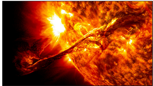
"Giant prominence on the sun erupted" by NASA/SDO/ AIA/Goddard Space Flight Center is in the public domain.